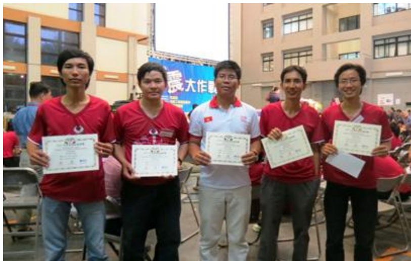
The DTU team at the IDEERS Competition

With tuition fee of 18,000,000 vnd/year (about $900/year), CSU students at DTU will ultimately receive Bachelor of Architecture degrees from Duy Tan University, consisting of at least 18 courses, issued by Cal Poly on graduation. After the first or the second year of study at DTU, they will be able to apply for a transfer program to Cal Poly and return to Vietnam for employment on graduation.