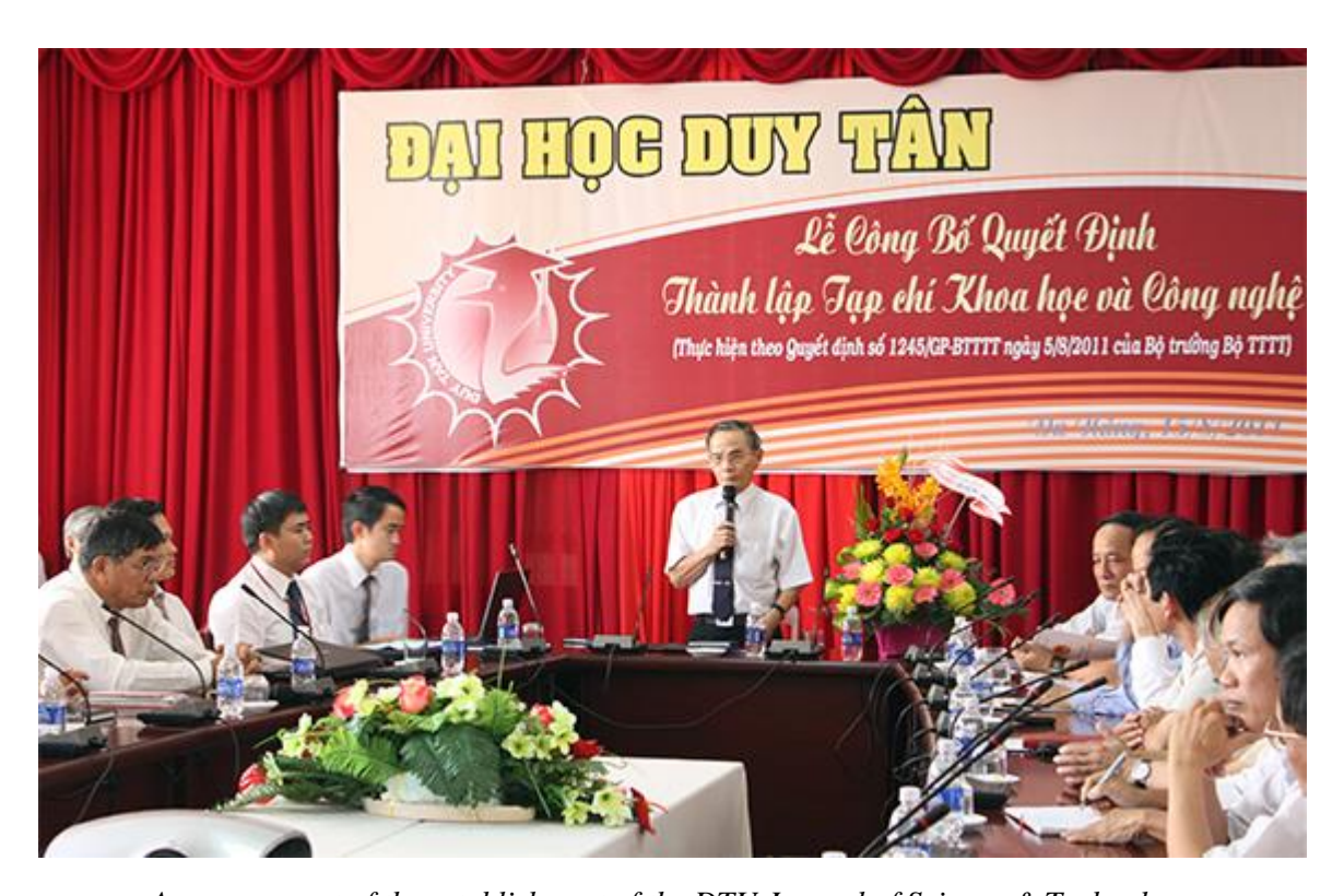
Announcement of the establishment of the DTU Journal of Science & Technology

The Ministry of Information & Communications issued the DTU Journal of Science & Technology its first print press license in 2011 and the National Agency for IT of the Ministry of Science & Technology assigned DTU an ISSN number in 2012.