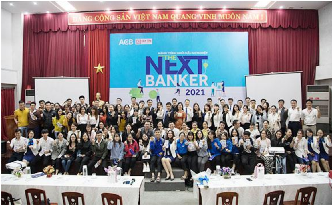
The Asia Commercial Bank Danang branch and DTU lecturers and students