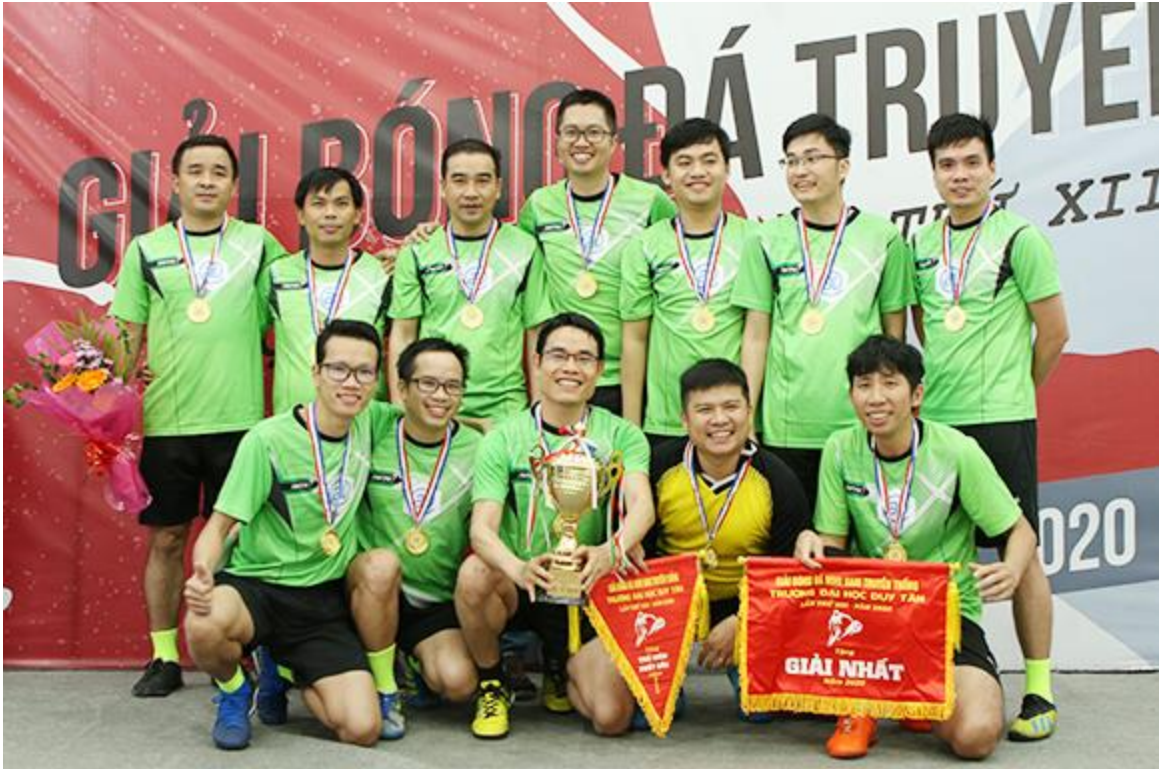
The Institute of Research and Development team