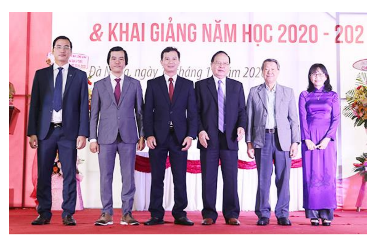
DTU introduces its five new schools