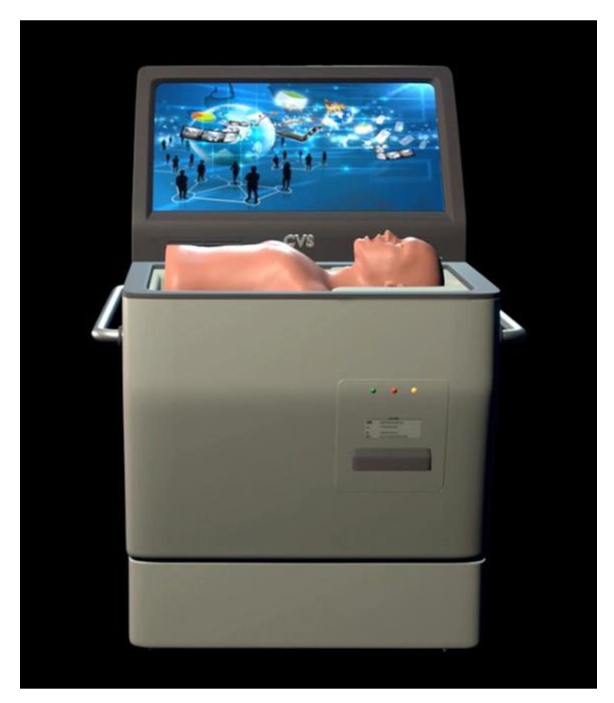
The DTU eCPR