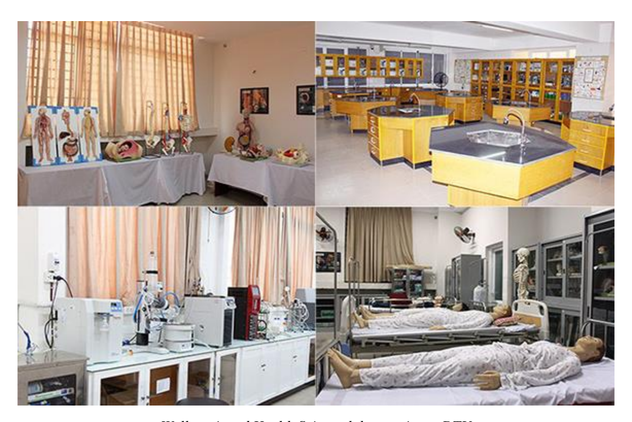
Well-equipped Health Science laboratories at DTU

Students will also be able to practice on virtual patients in the MedSim Center, which is being built on the Hoa Khanh Nam campus at a cost of 200 billion dong.