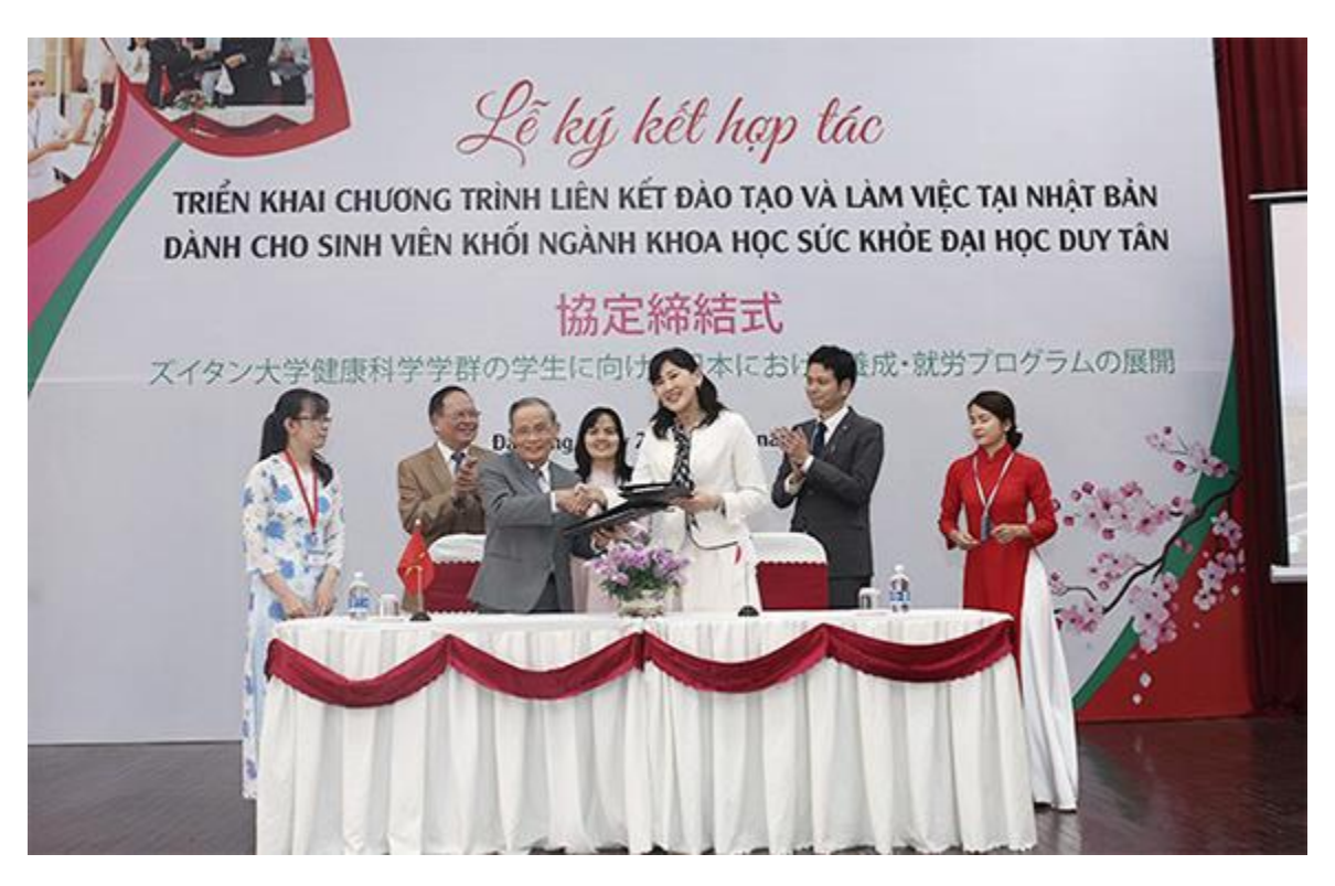
International collaboration to improve the quality of education

DTU has been offering Health Science programs over the past eleven years, and is now recognized for its expertise in educating professional health care workers to try to satisfy the growing needs of the Central region. So what are the advantages of studying Health Science at DTU?