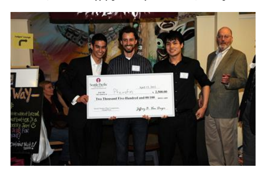
Pterofin - the champion of SVPC 2011

At this year's SVPC, held on April 13 from 2 to 6 p.m., a group from University of Washington won the grand prize for their project called "Pterofin," created to supply generated power to homes, buildings and offices.