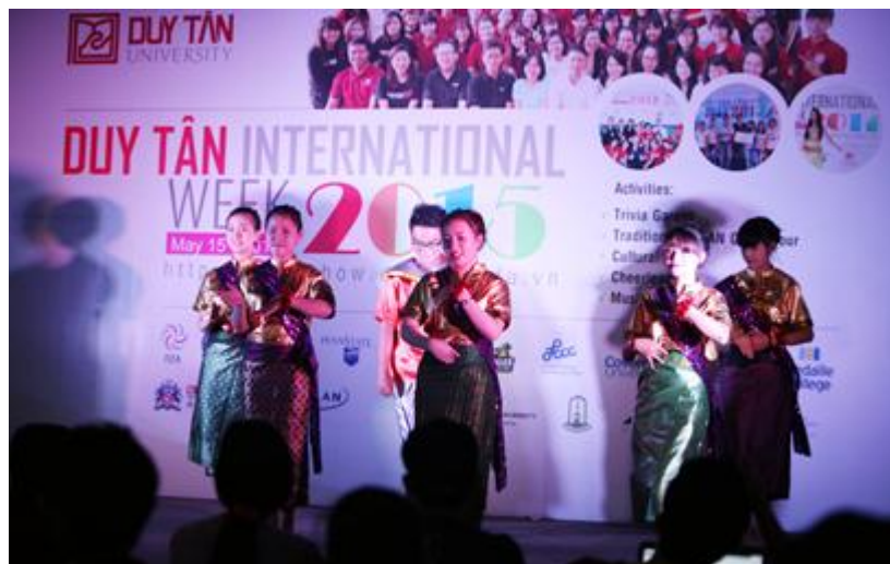
A musical performance

On 15th May, the 2015 DTU International Week was celebrated to increase students' understanding of the ASEAN community through many exciting activities.