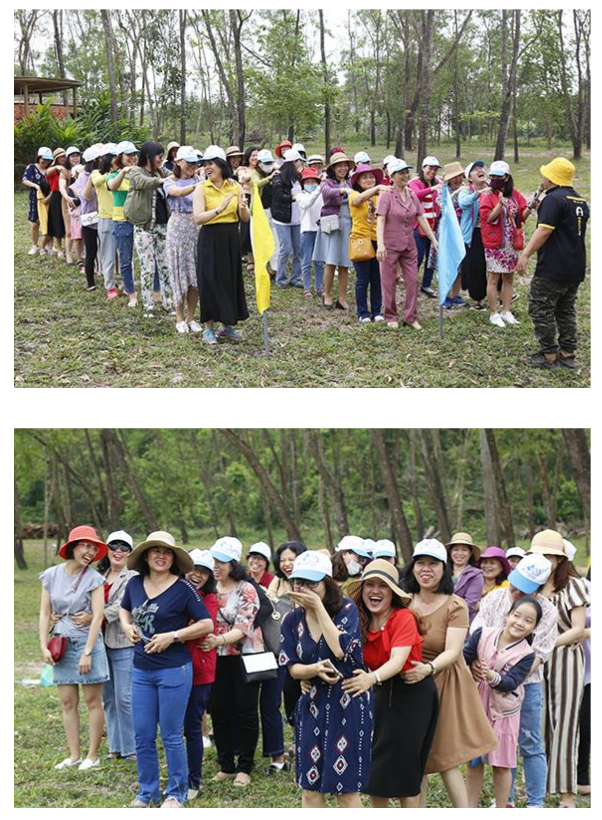
Teambuilding and other activities, with three teams