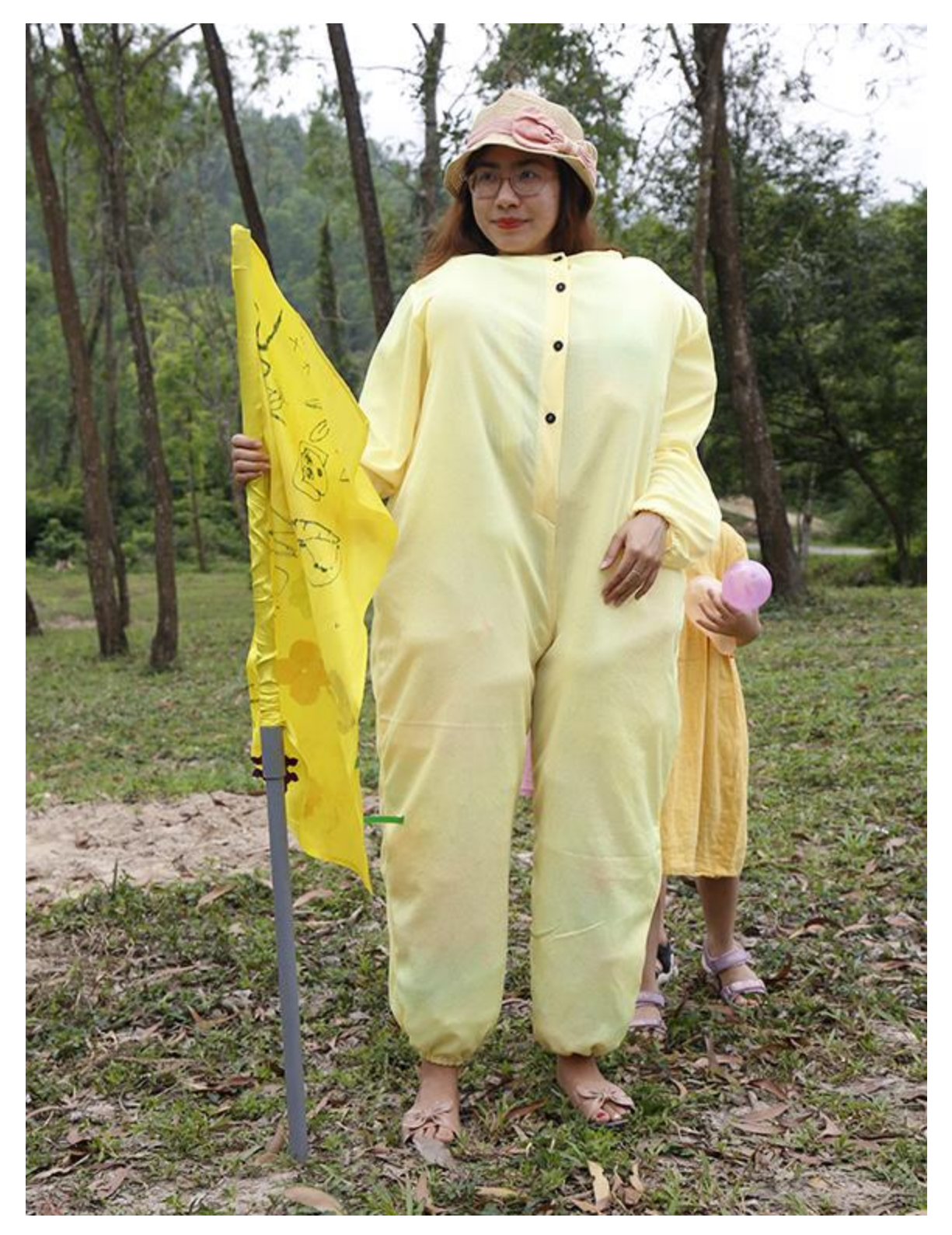
Attractive muscles of the team Yellow strongwoman