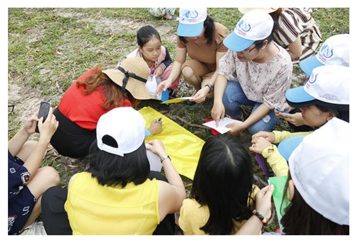
"Team Flag Decoration", teams decorate their flags and explain their meaning