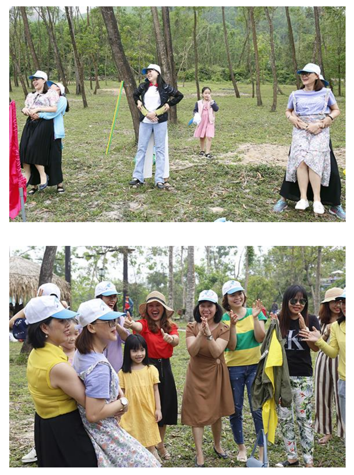
"Who is the Toughest?", deputy team-captains carry their captain and the strongest team wins