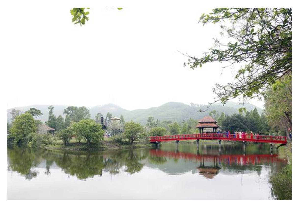
The Alba Thanh Tan Hot Springs