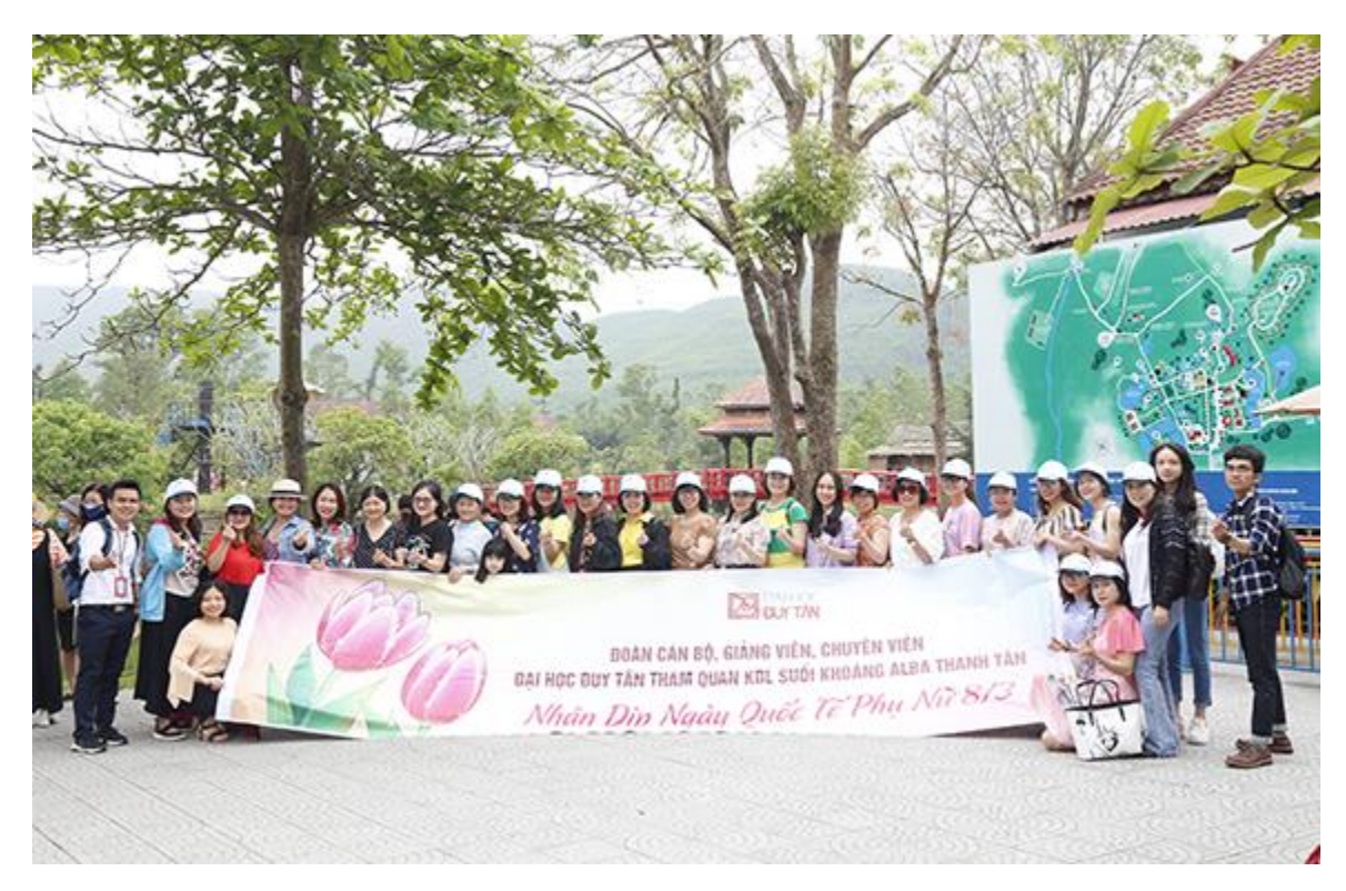
Women DTU staff, lecturers and employees visit the springs