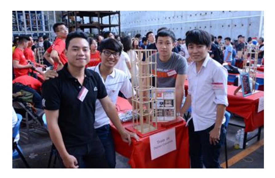
The DTU IDEERS team with their model

The DTU IDEERS team, the only Vietnamese participants, came third in the "Introducing and Demonstrating Earthquake Engineering Research in Schools - IDEERS" contest held in Taiwan. Forty-two ASEAN universities participated from September 16th to 21st.