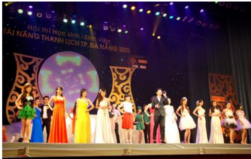
Contestants in the 2012 Miss Danang Fashion Contest