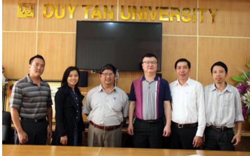
DTU and KIICE representatives

The upcoming international Conference on Information Technology, to be hosted by KIICE in Danang in June 2016, was discussed. KIICE chose DTU as a potential partner who has already successfully organized several similar conferences. DTU researchers plan to submit papers to help contribute to the success of the conference.