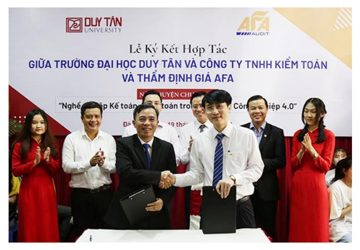
DTU signs an agreement with the AFA Audit & Appraisal Company