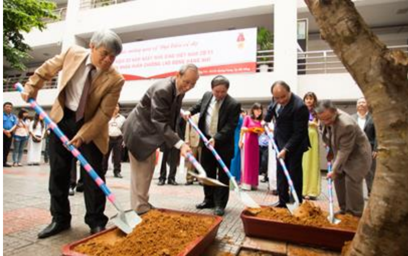
Planting a memorial tree at DTU