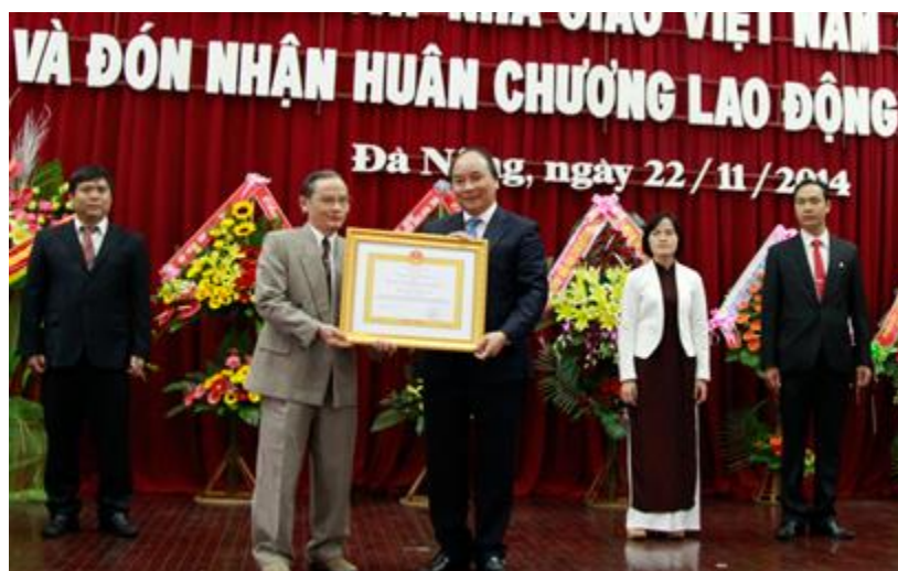
Deputy Prime Minister Nguyen Xuan Phuc hands DTU the Second Class Labor Medal

On November 22, 2014, Deputy Prime Minister Nguyen Xuan Phuc, on behalf of the Party and State, awarded DTU the Second Class Labor Medal, for its outstanding achievements in education from academic year 2009-2010 to 2013-2014, and for its contributions to the building of Socialism and protection of the Fatherland. This high honor and the recognition and sincere advice from the Party and State leaders will give motivation and new impetus to DTU efforts and commitment to building the university and to contribute to the development of education.