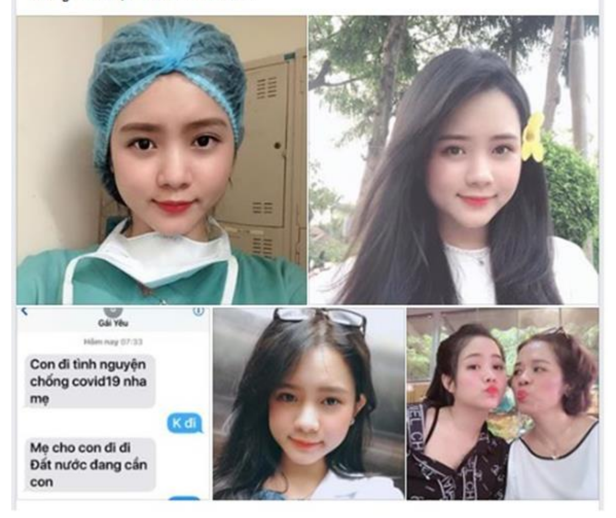
Messages between mother and daughter before making a decision

Cả nhà toàn thanh niên, chỉ có mỗi cô con gái đang học bs năm thứ 5. Nhà trường cho nghỉ học vì dịch covid-19, ấy thế mà bạn ấy lại tự nguyện đi tham gia chống dịch ... để mặc cho mẹ lo lắng!!! Mong con mạnh khoẻ bình an!!!