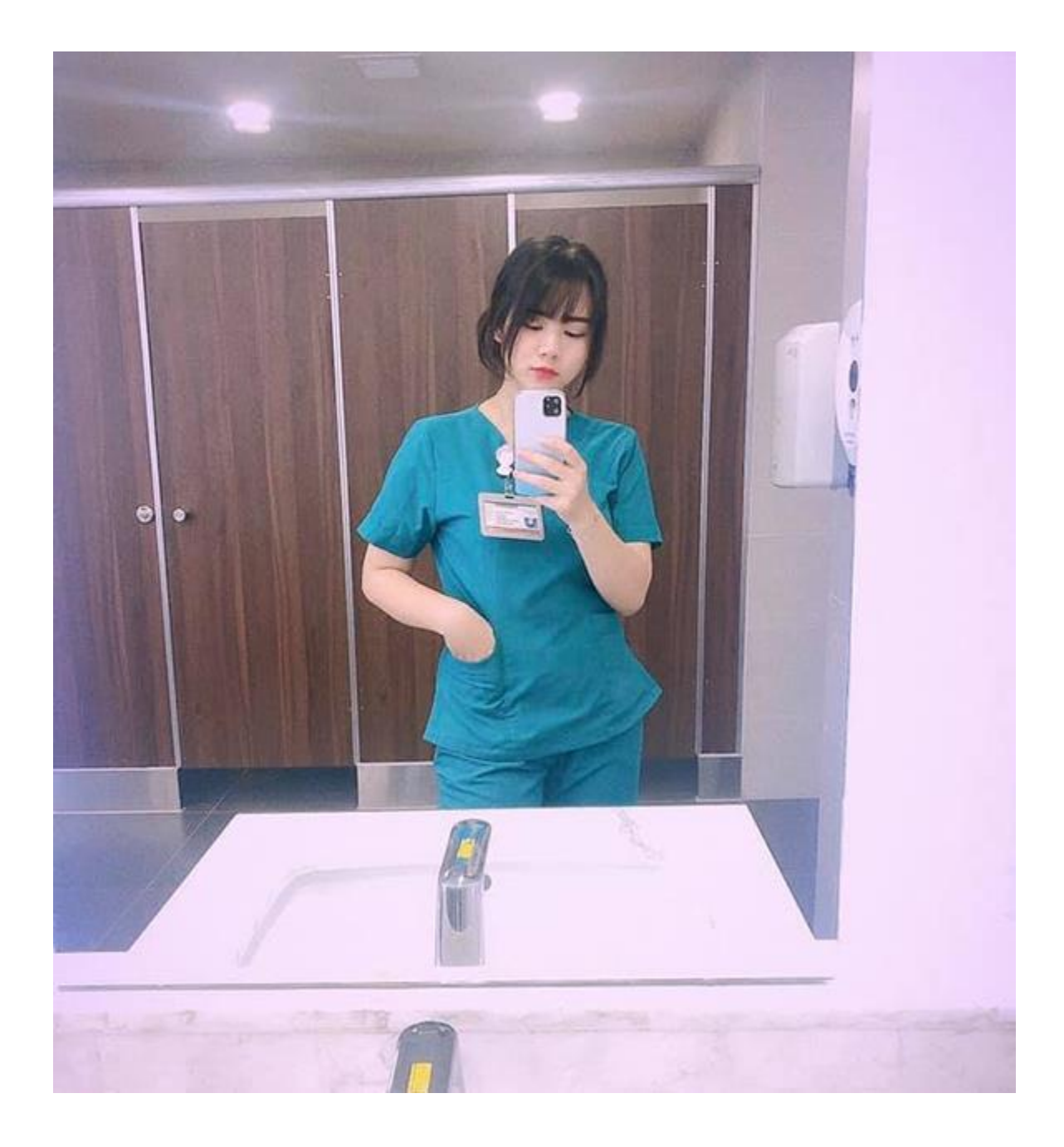
And this is what she told the Vietnamnet newspaper: "When I first saw the request for volunteers on the Faculty of Medicine website, I asked my mother for permission. Although she didn't approve, I decided to apply to make a small contribution to fighting the virus and hope it will be under control very soon."